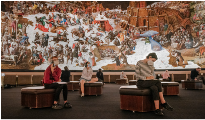
Werner Tübke: Frühbürgerliche Revolution in Deutschland , 1983/87 oil on canvas, 14 x 123 m, installation view, Panorama Museum, Bad Frankenhausen

TÜBKE TOUCH is a cloud application developed by Centrica for digital art education. Using a touchscreen, whiteboard, or computer screen, one is able to look at Tübke's image as a whole and also zoom into specific details. Different viewing options, for example by theme, entail additional information. TÜBKE TOUCH offers an immediate and intensive exploration of the work of art, which is almost impossible to grasp in its original format due to its immense size and the multiplicity of figures it entails.