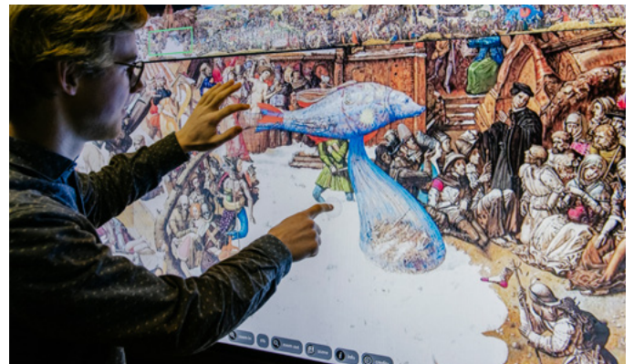
Centrica: TÜBKE TOUCH , 2021 cloud based ArtCentrica application

PANORAMA MUSEUM Am Schlachtberg 9 06567 Bad Frankenhausen