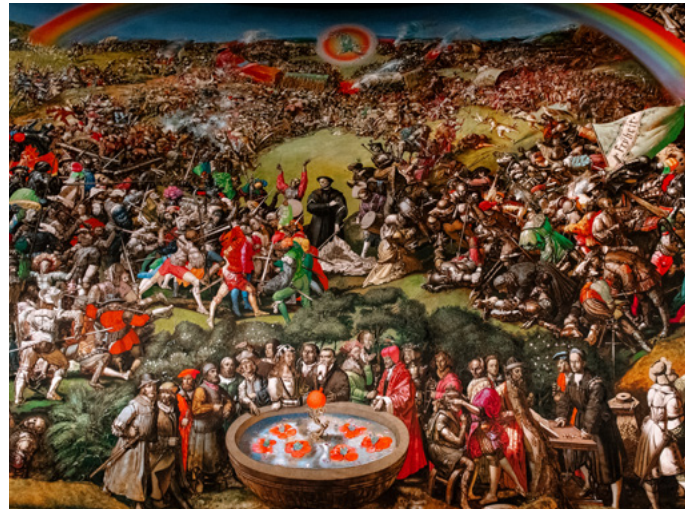
Werner Tübke: Frühbürgerliche Revolution in Deutschland , 1983/87 oil on canvas, 14 x 123 m, installation view, Panorama Museum, Bad Frankenhausen

An immersive light and sound installation in the form of a 27-minute presentation was developed for the spaces of the KUNSTKRAFTWERK out of the high-resolution images taken by Centrica . A stunning composition of images and sounds was developed around Werner Tübke's epic painting about the German Peasant Wars. It was created under the direction